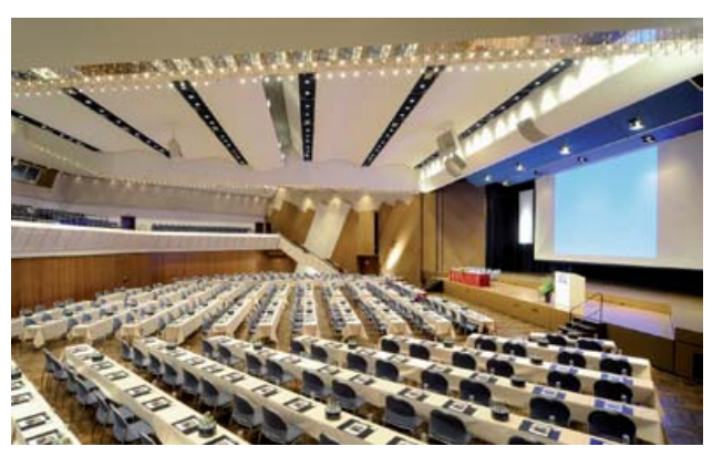
Plenary room "Frankonia" next to the exhibition area