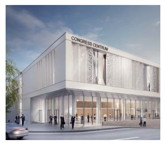
New Congress Centrum Würzburg

Don't miss it - be a sponsor/exhibitor of the conference!