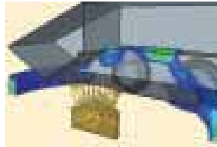
Simulation of landmine explosion