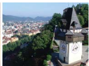
SCHLOSSBERG Am Schlossberg 7 A-8010 Graz