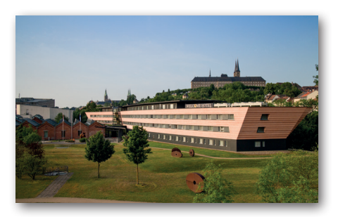
Welcome Kongresshotel Bamberg